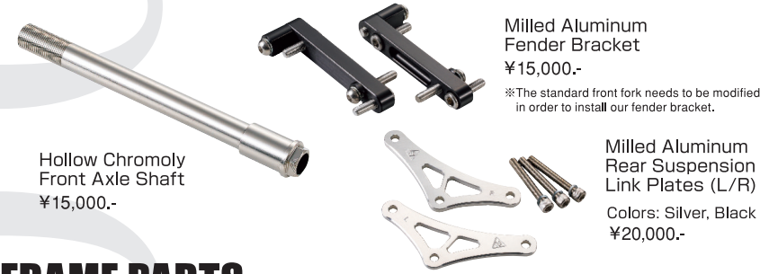
Hollow Chromoly Front Axle Shaft ¥15,000.-

Improved stiffness and rigidity result in more information being transferred to the rider, leading to a direct feeling. Combined with the increased shock absorption of MAGTAN forged magnesium wheels a synergy effect leads to lighter and more stable cornering, giving you total peace of mind.