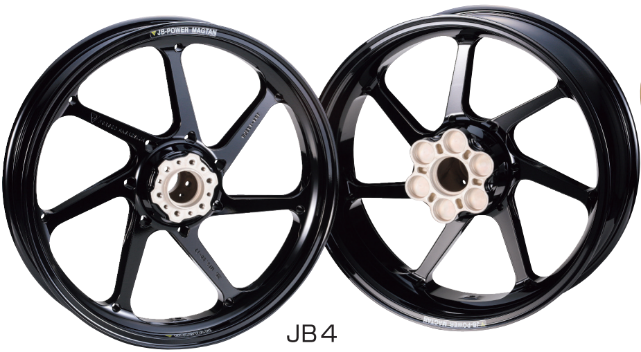
JB4 MAGTAN Forged Magnesium Wheel Set ¥350,000.-