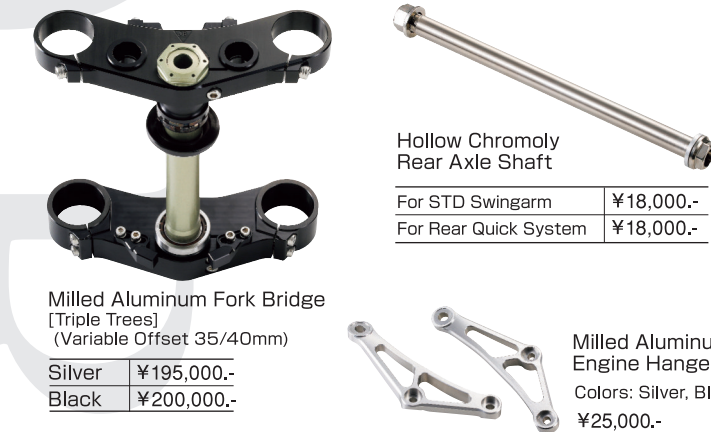
Hollow Chromoly Rear Axle Shaft

Swapping to the JB-POWER Fork Bridge (triple trees) leads to neutral handling and increased riding stability, providing a sense of control, to fully enjoy yourself. Because Fork Bridge and Step (rear set) are variable, they can be easily adjusted to the situation and the riders' preference.