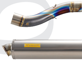
Hand Bend Titanium Exhaust System 4 into 1, Straight Silencer, Incl. Catalizer ¥330,000.-