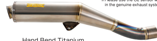
Hand Bend Titanium Exhaust System 4 into 1, Angled Megaphone Silencer, Incl. Catalizer ¥330,000.-

※Race use only. ※Please use the O2 sensor which is installed in the genuine exhaust system.