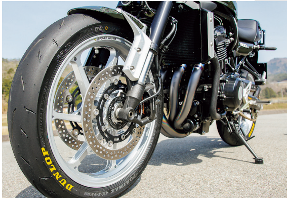
Milled Aluminum Spacer Collar for Radial Mount Brake Caliper 6POT Colors: Silver, Black, Hard Anodized 1PCS ¥2,500.- ※Bots are included in Radial Mount Brake Caliper 6POT.