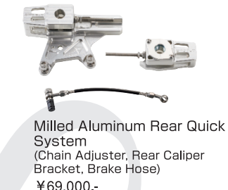
Milled Aluminum Rear Quick System (Chain Adjuster, Rear Caliper Bracket, Brake Hose) ¥69,000.- ※The standard swingarm needs to be modified in order to install our rear quick system.