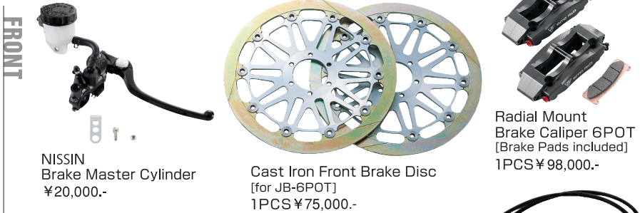
NISSIN Brake Master Cylinder ¥20,000.-

Although the genuine brake system is equipped with enough braking power and no change seems necessary, changing the rear brake layout massively improved the overall brake force balance and the rear quick systems greatly enhances maintainability.